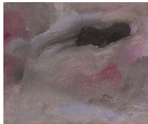
Weathering, I , 1989 10 x 12in, oil on canvas (o/c 1596)