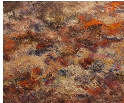
Burnt Umber , 1956 30 x 36 in, oil on canvas (o/c 56-27)

Paintings by Jon Schueler will be part of the Waterhouse & Dodd, NY display at Art Miami from December 5-8 th , 2019